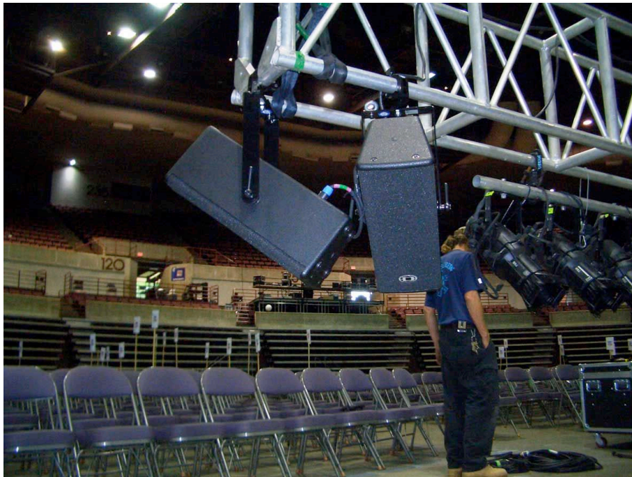
VL262 boxes await deployment on the main stage truss